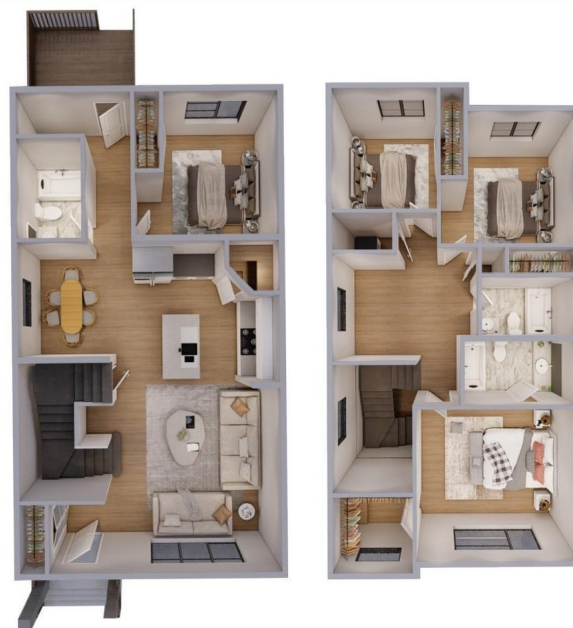
869 SQ.FT. MAIN FLOOR

Date Listed March 7th, 2025 Days on Market 35 Zoning Zone 91